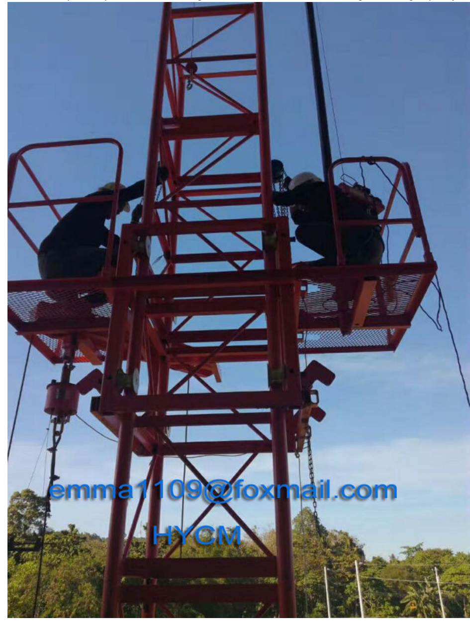
ZLP Suspended Platform and SJY Scissor Lift

SS Building Material Lift / Hoist ------ Wire rope lift, special material lifting work in construction site, 1000kg to 2000kg capacity, no passenger, up to 60m.