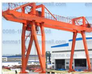
Double Girder gantry crane