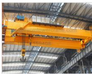
Double Beam Bridge Crane