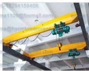
Single Beam Bridge Crane