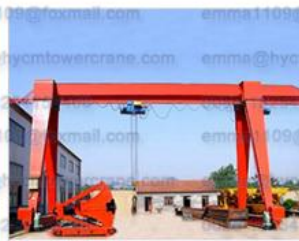
Rubber tyred gantry crane