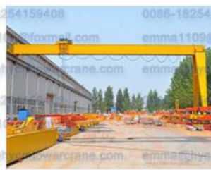
Half gantry crane