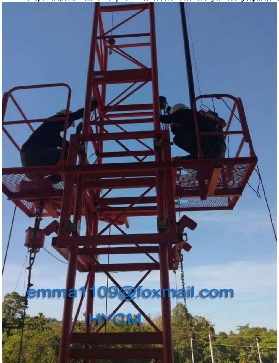
Working Platforms ZLP

SS Building Material Lift / Hoist ----- Wire rope lift, special material lifting work in construction site, 1000kg to 2000kg capacity, no passenger, up to 60m.