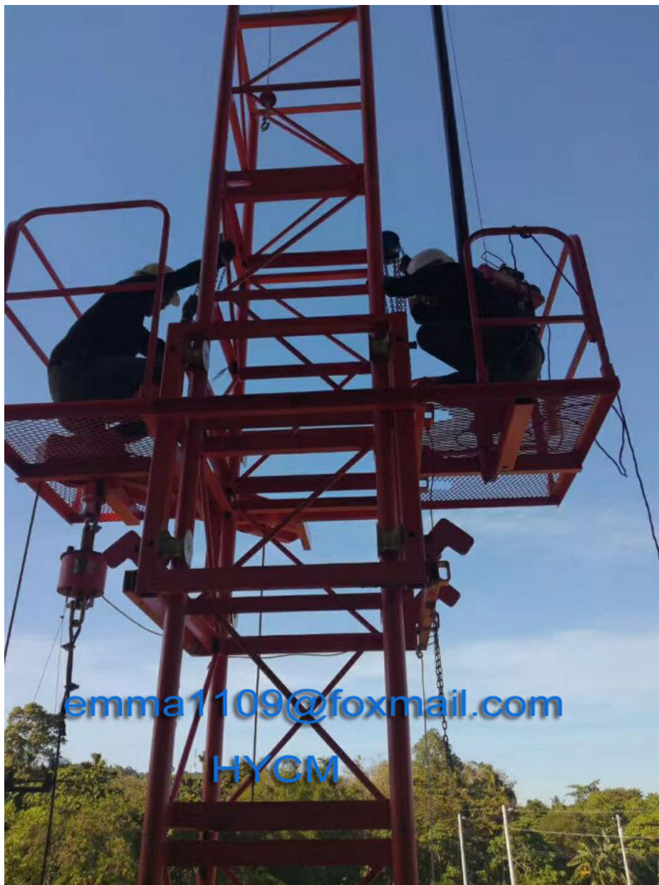
Working Platforms ZLP