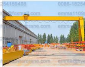
Half gantry crane