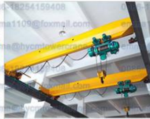
Single Beam Bridge Crane