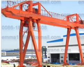
Double Girder gantry crane