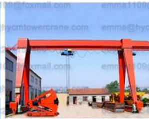
Rubber tyred gantry crane