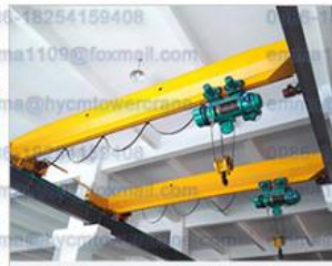
Single Beam Bridge Crane