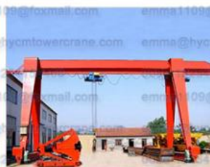
Rubber tyred gantry crane

Our advantage 1. Choose high-quality materials 2. One-stop customized service 3. Professional after-sales team