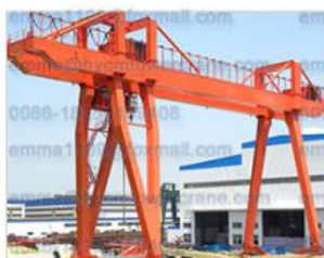
Double Girder gantry crane

Our advantage 1. Choose high-quality materials 2. One-stop customized service 3. Professional after-sales team