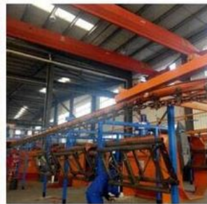
Power spray painting line

To ensure Efficient and high quality semi parts