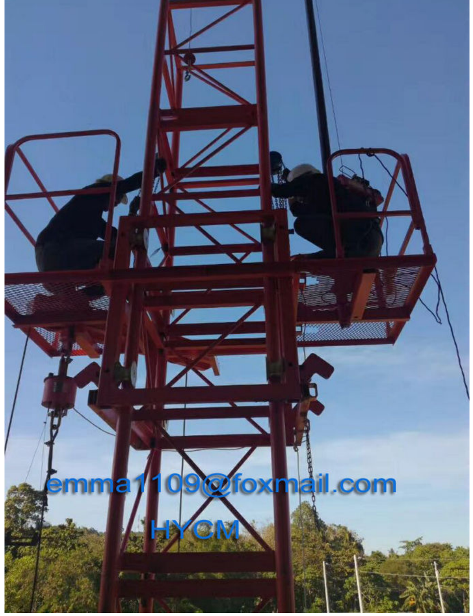
Working Platforms ZLP