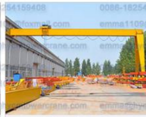
Half gantry crane