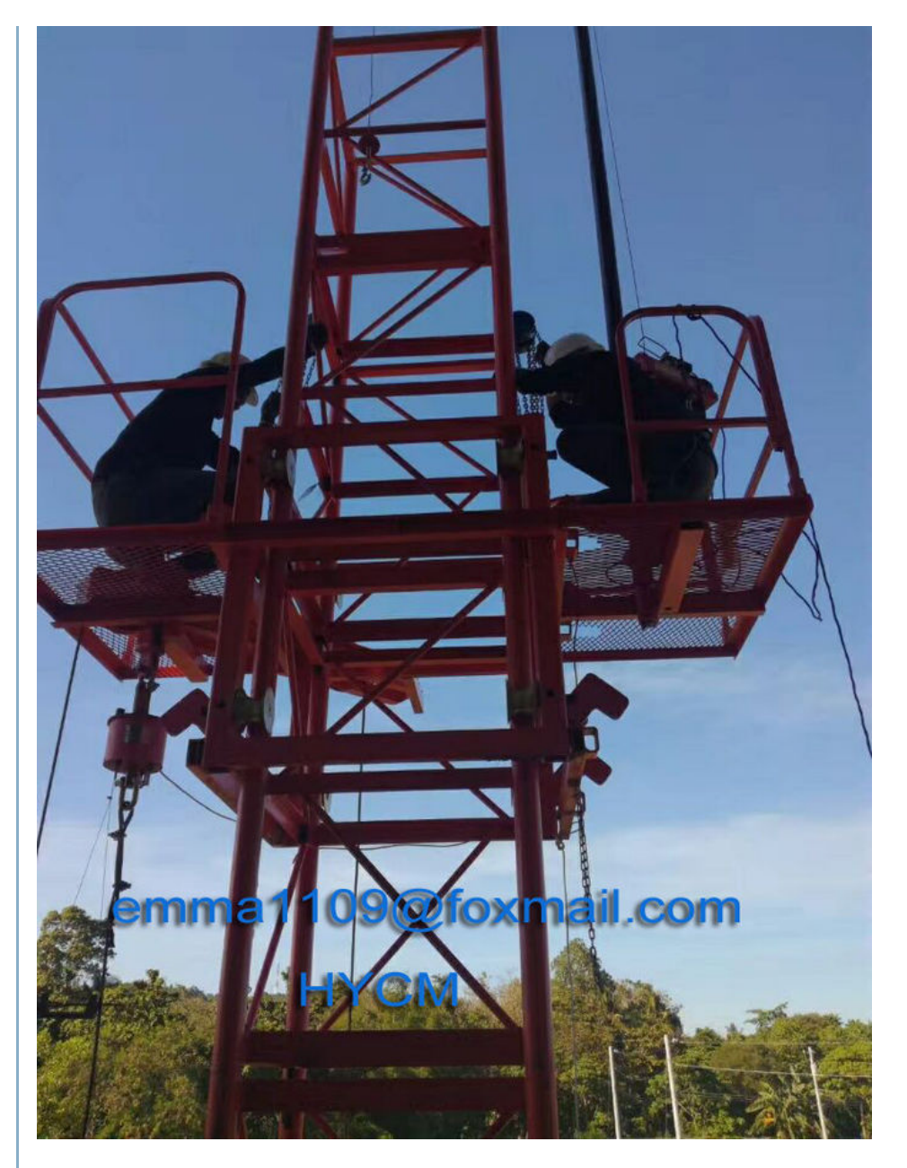
SJY Scissor Lift