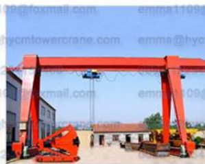
Rubber tyred gantry crane