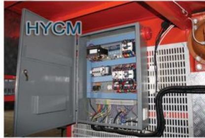
Electrical control box