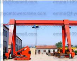
Rubber tyred gantry crane