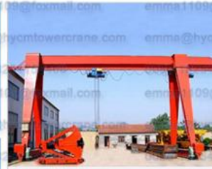
Rubber tyred gantry crane