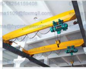
Single Beam Bridge Crane