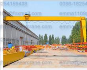
Half gantry crane