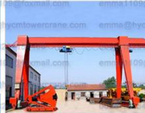
Rubber tyred gantry crane