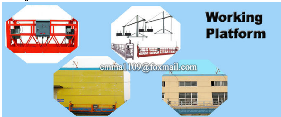
Working Platforms ZLP