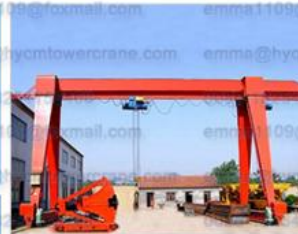
Rubber tyred gantry crane