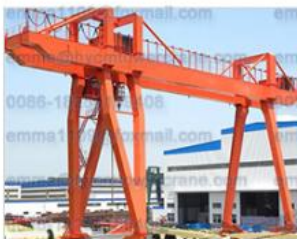
Double Girder gantry crane