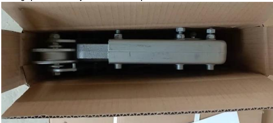
Package photos of Safety Lock for ZLP Suspended Platform